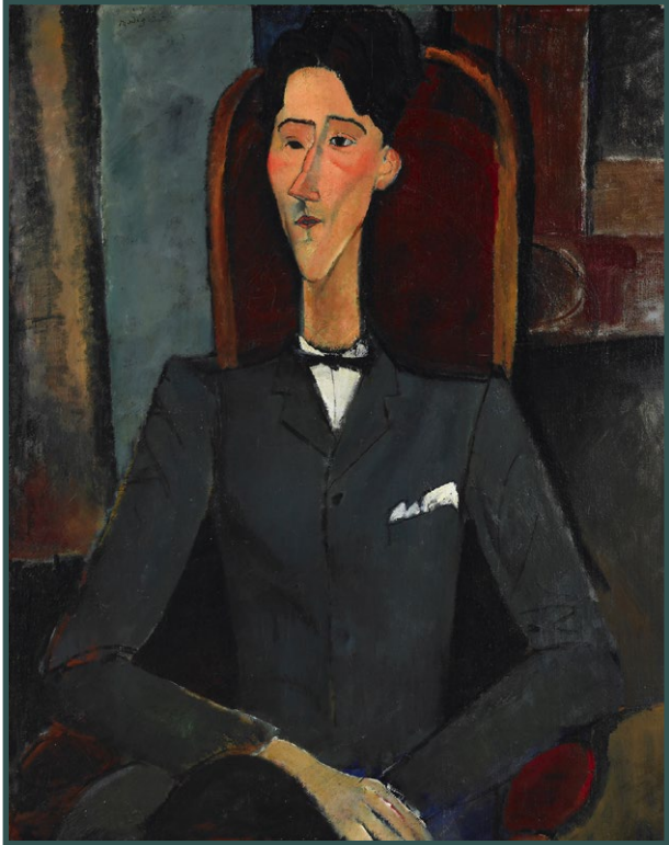
Amedeo Modigliani, Jean Cocteau , 1916. The Henry and Rose Pearlman Foundation, on long-term loan to the Princeton University Art Museum

Amedeo Modigliani was an Italian artist who lived most of his adult life in Paris. He is well known for his portraits.