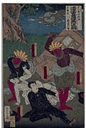
Japanese Meiji period , 1868–1912 Adachi Ginkō , active 1874–1897 The Strange Tale of the Castaways: a Western Kabuki (Hyōryū kidon yōkabuki) , 1879 Woodblock print (ōban tate-e format); ink and color on paper Museum purchase, Anne van Biema Collection Fund (2006-33)