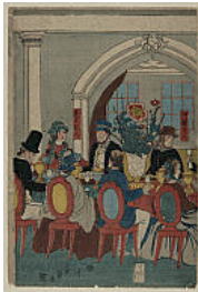
Japanese Edo period , 1600–1868 Utagawa Yoshikazu (Ichijusai) , active 1850s–1860s Banquet of Foreigners from the Five Countries , 1861 Woodblock print (ōban tate-e format); ink and color on paper Gift of Mr. and Mrs. Jerome Straka(x1983-78)