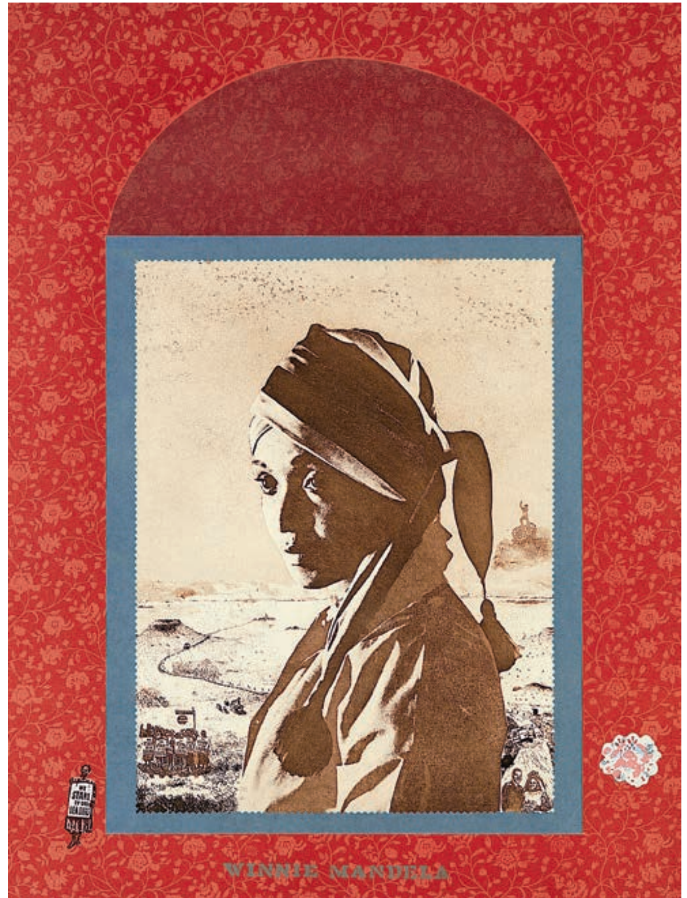
FIGS. 7, 8