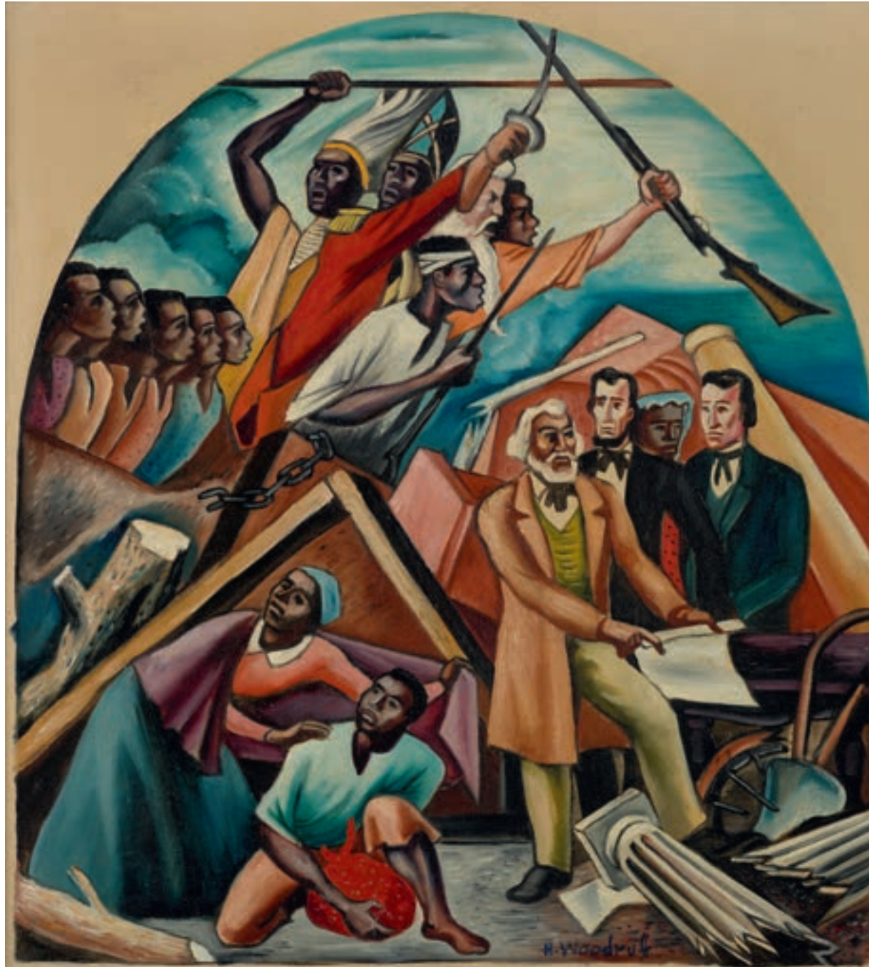
Hale Aspacio Woodruff 1900–1980; born Cairo, IL; died New York, NY Study for The Art of the Negro , panel 4, 1945 Oil on canvas Museum purchase, Fowler McCormick, Class of 1921, Fund (2025-1)

Woodruff painted this study for The Art of the Negro in 1945 during his final months living and teaching in Atlanta before relocating to New York City. The composition reflects Woodruff's original ideas for the mural cycle, which he first proposed for the Trevor Arnett Library at Atlanta University (now Clark Atlanta University) in 1938. In this study for panel four of the cycle, the composition is surmounted by a pantheon of liberators, including Cinque, leader of the Amistad Uprising; the Haitian revolutionary Toussaint Louverture; the fallen Crispus Attucks of the American Revolution; the abolitionist John Brown; and possibly the enslaved rebellion leader Nat Turner.