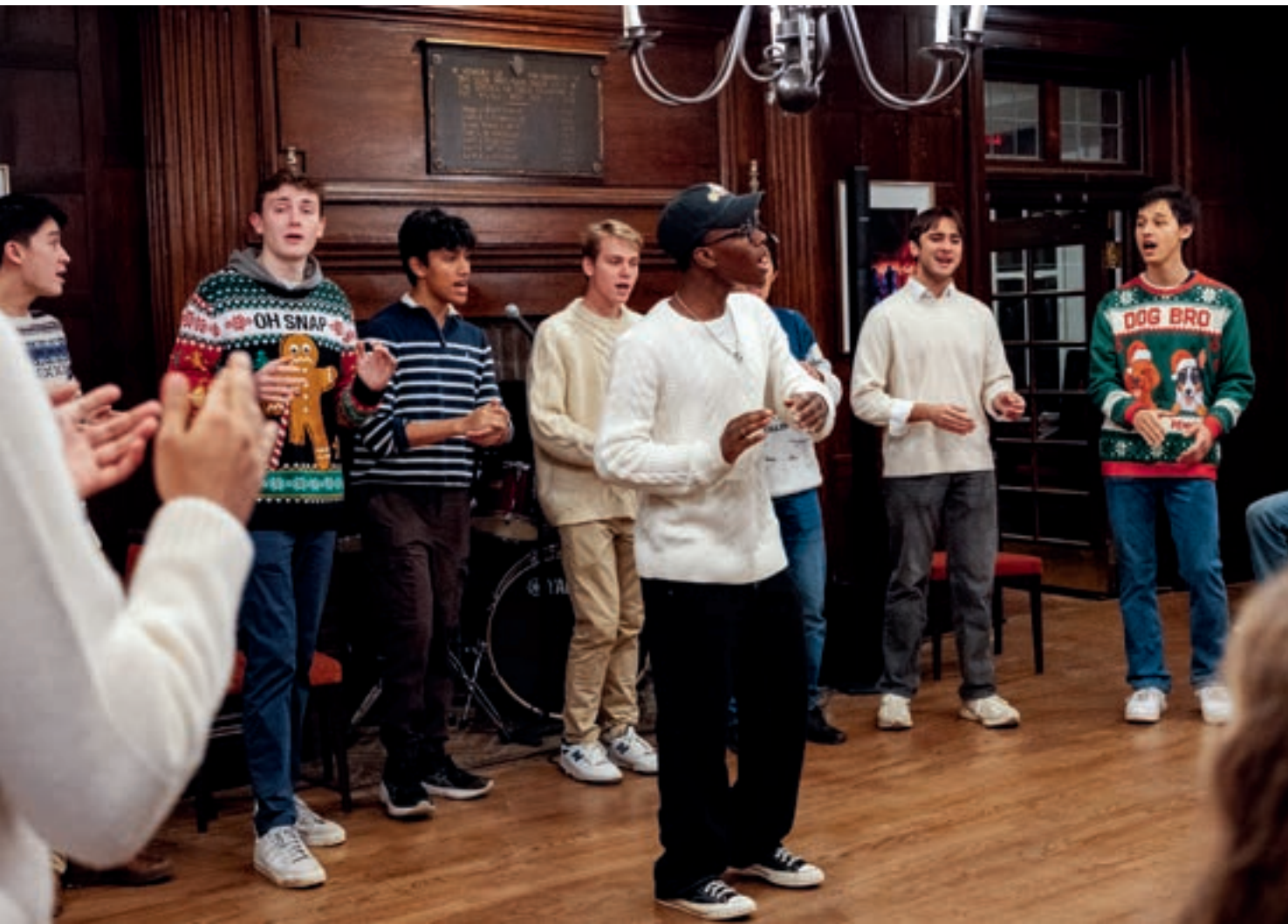
OPPOSITE: FIGS. 44, 45 RIGHT: FIGS. 46, 47, 48