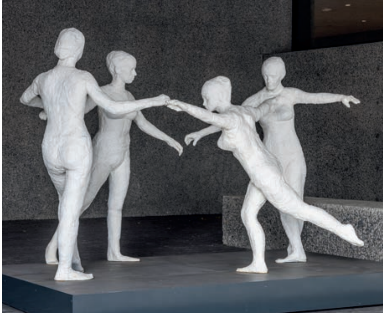
George Segal 1924–2000; born New York, NY; died South Brunswick, NJ The Dancers , 1971, cast 1982 Bronze, white patina, paint, and steel Gift of The Locks Foundation (2024-507 a-d)

In The Dancers , Segal looked back both to Henri Matisse's seminal Dance paintings of 1909 and 1910, and to an earlier moment within his own career when he was working primarily in plaster. Segal created the plaster version of The Dancers in 1971, after seeing the Dance paintings in Paris in 1970, but he made significant changes to Matisse's composition, reducing the number of dancers, draining them of color, and rendering them less abstract. The figures were cast from live models, capturing their efforts to balance and coordinate—a more sedate contrast to Matisse's whirling figures.