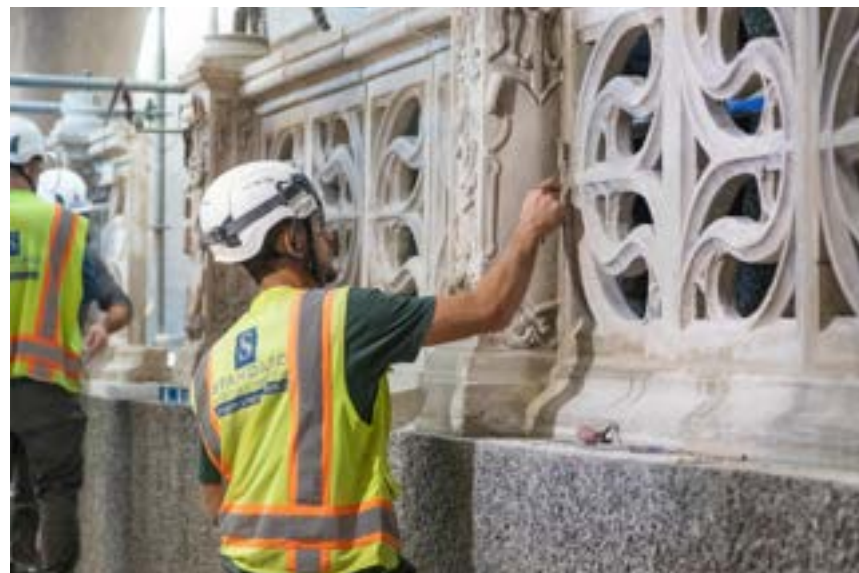
FIGS. 13, 14